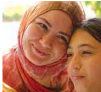
Recently naturalized U.S. citizens

HCC Life Short Term Medical (STM) provides affordable temporary health insurance to protect you and your family. You should consider purchasing HCC Life STM if you are concerned about protecting yourself from the potentially high medical costs associated with an unexpected sickness or injury.