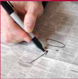
TRANSITIONING BETWEEN JOBS