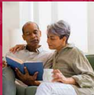
WAITING FOR MEDICARE COVERAGE