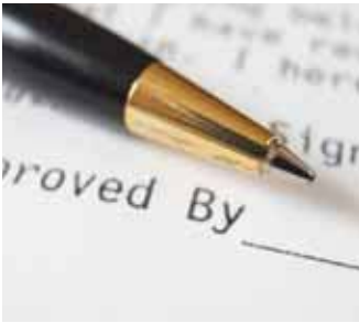
Waiting for major medical